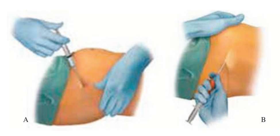
Figure 2. A-B, Harvesting of adipose tissue.

After a first period (approximately 10 days) of worsening of pain, symptoms got progressively better and the pain completely disappeared in 6 weeks.