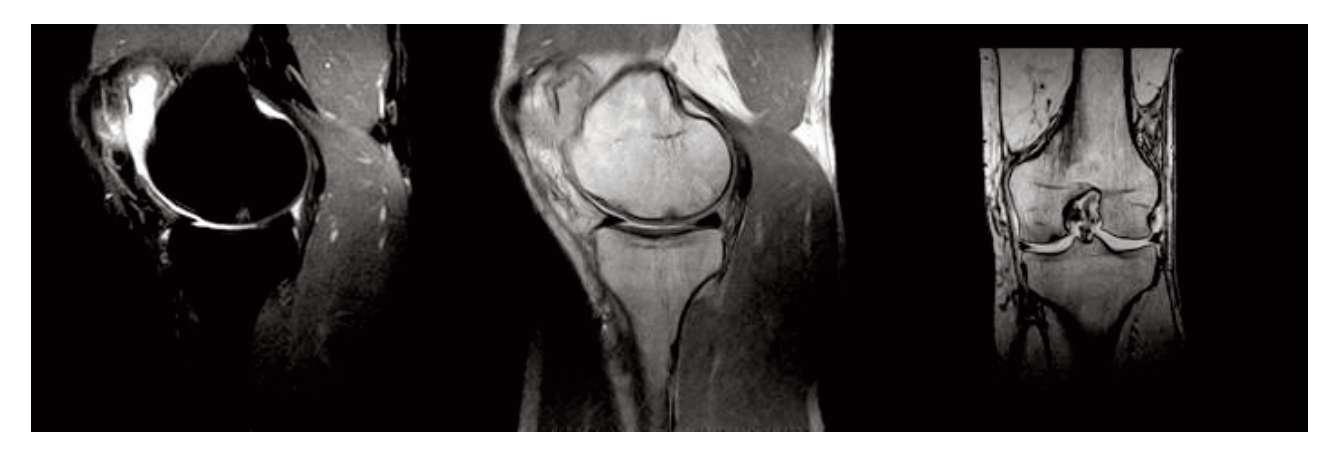
Figure 1. Chondral lesion in the medial femoral condyle after knee trauma. In both STIR and T2 weighted sequences it's well documented a focal chondral lesion (Outerbridge 3) with subchondral edema.

The patient was discharged the same day, with the prescription of a period of relative rest and protected weight bearing for about 10 days. At 2 weeks, the patient resumed usual activities, including sports, but, 3 months after, was selected for a single injection of autologous micro-fragmented adipose tissue (Lipogems<sup>®</sup>) because of the persistence of pain and the unsatisfactory results. No restrictions of activity nor rehabilitation protocol after Lipogems<sup>®</sup> treatment were done for this patient, which was treated as an outpatient. Full weight bearing and walking was permitted.